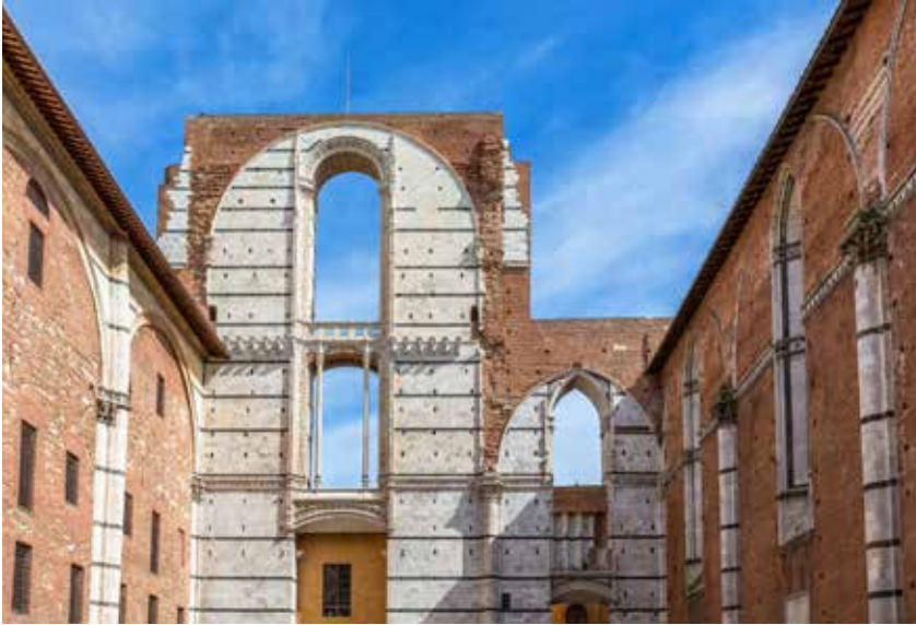
The Facciatone as it stands today. Istock photo. Stock Photos|Ancient

The current COVID-19 pandemic differs significantly from the Black Death. While more than one million Americans have died of SARS-CoV-2 infection, the COVID-19 mortality rate is dwarfed by that of the Black Death, which is estimated to have killed between one-third and two-thirds of the European population. 6 Today, we have highly effective vaccines and antiviral treatments against the SARS-CoV-2 virus, whereas, in 1348, none were available against Yersinia pestis , the causative agent of bubonic plague recognized 550 years later. 7 Today we understand the cause and the dynamics of spread of SARS-CoV-2 infection and have instituted effective mitigation strategies for prevention of COVID-19, whereas the Black Death, along with many other microbial infections, was, at the time, thought to be the result of a miasma, or bad air. 8