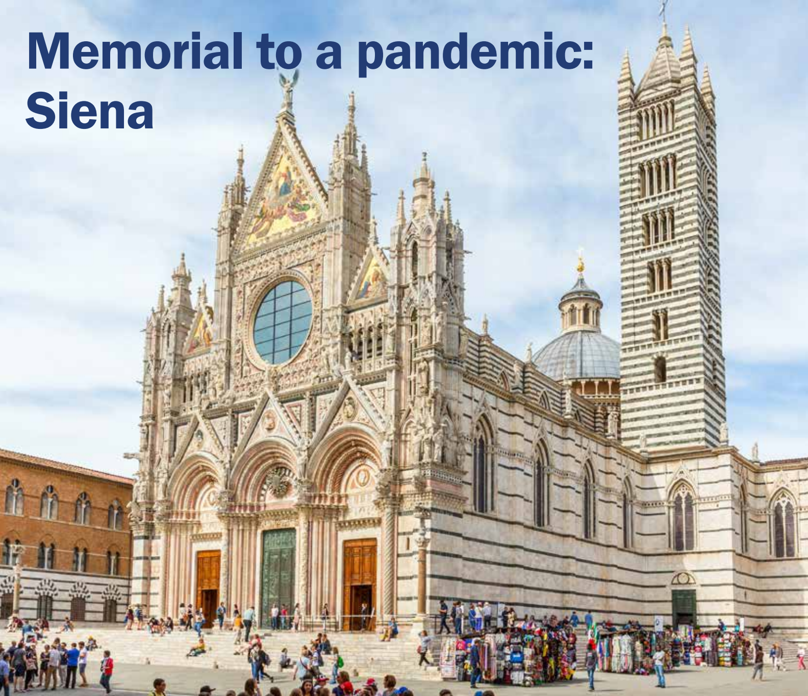
The exterior of the Duomo in Siena, Italy. The Facciataone remains are located to the right of the Duomo (not pictured).